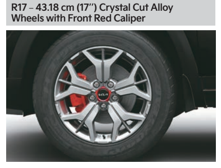
An absolute showstopper. One glance, and you'll know why