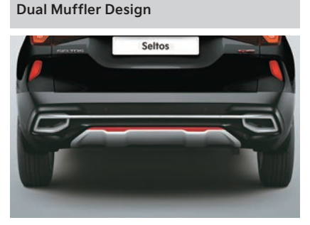
Adds to the tough looks and provides a strong road presence