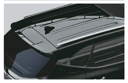
Give a sporty and dynamic appeal to the badass design