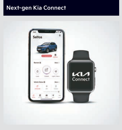
Elevates your connected car experience in an inspiring way with 58 smart features