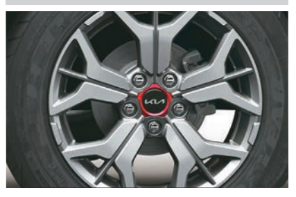
Let you stay in control in case of accidental braking