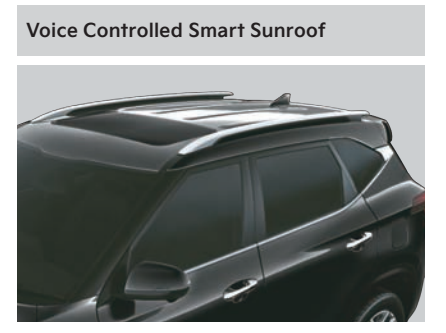
Lets you stay connected to the outside world