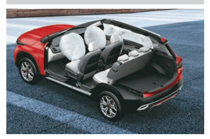
Provide superior safety making your every drive safe and worry-free