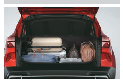
Allows easy access and spacious enough to accommodate luggage for a weekend trip