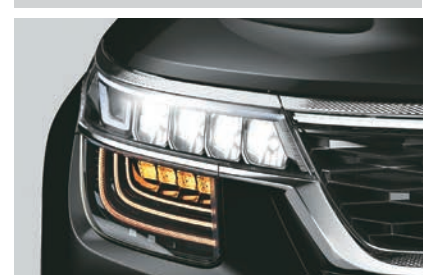
Provide a distinctive bold character and better visibility in the dark