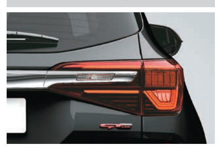
Complement the muscular back to give it a premium appearance