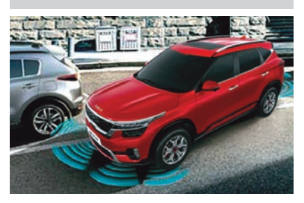
Help you safely maneuver and park in peculiar Indian conditions