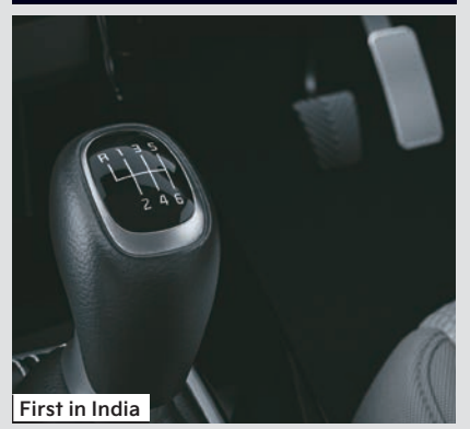
Lets you enjoy the ease of driving with a clutch-free+ and manual transmission, even with diesel engines