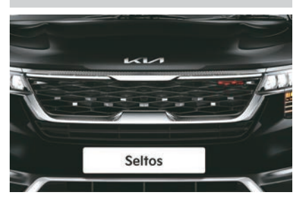
Lends an aggressive attitude to the front