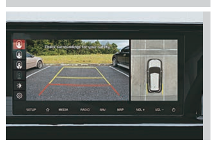
Keeps you aware of surroundings at all times