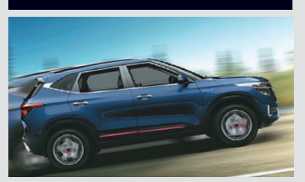
Come as a part of standard safety package making your journey safe & reliable