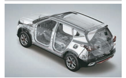
Provides enhanced safety and rugged strength to your Kia Seltos