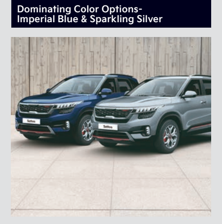
Allows you to announce your arrival as the colors complement your badass personality