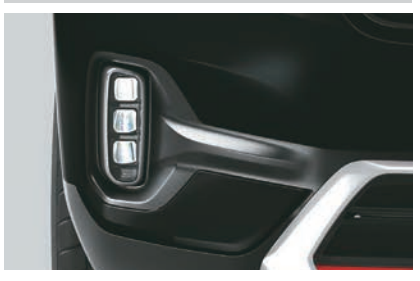
Enhance the overall sporty appeal