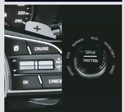
Help with quick gear shifts at the touch of a finger and makes the drive more thrilling on different terrains